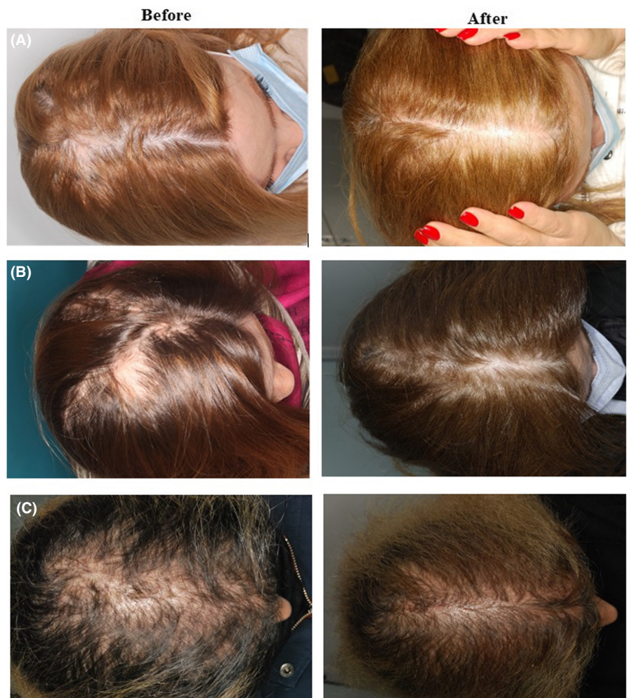
FIGURE 1 Study patients: Patient A with an alopecia patch on the top of the scalp progressing to the crown, patient B with an alopecia patch on the top of the scalp and another patch on the left side of the scalp and patient C with scattered alopecia areas from frontal to the crown before the treatment and 12 months after the treatment

present unfavorable adverse effects such as immunosuppression that limit their use; hence, localized treatment can play an essential role. Carboxytherapy has frequently been used for cosmetic and therapeutic purposes in recent years. 2,3 Carbon dioxide (CO 2 ) induced hypercapnia and decreased pH increase blood supply and oxygen transportation to the site of injection. 4 The promising effects of carboxytherapy, especially in patients with alopecia, prompted us to the current study. In this study, nine patients (20–50) with