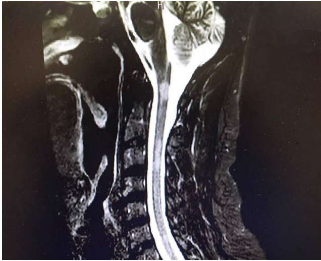
FIGURE 1 T2-STIR cervical MRI shows multiple bright lesions compatible with demyelinating disease (multiple sclerosis)

D3 50000 U weekly, Tab Hydroxychloroquine 200 mg QD, Tab Roaccutane 20 mg twice weekly and Eucerin + urea 5% cream. Figures 1-6 show neurological and dermatological manifestation of the reported case.