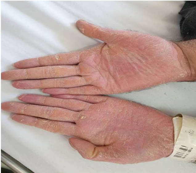
FIGURE 3 Arachnodactyly