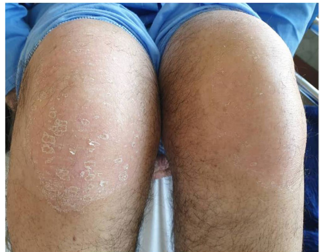
FIGURE 6 Knee hyperkeratosis

Finally, we reviewed and compared latest pubmed publications on PLS and HMS in the past 10 years. We summarized the most important and relevant articles on phenotypic variant, Haim-Munk syndrome, in Table 1.