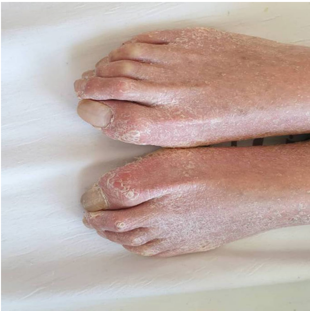
FIGURE 4 Flexion contracture of the toes

disease (Multiple sclerosis). He also suffered from depression and irritability.