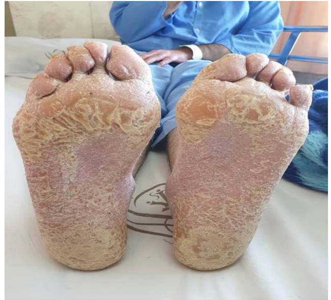
FIGURE 5 Plantar hyperkeratosis

In our opinion, our patient could have mutations in both cathepsin C and other cathepsins, like cathepsin D, or a novel cathepsin C mutation, resulting in neurologic manifestations. This requires further investigations.