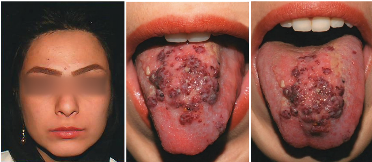
Figure 1. Lymphangioma lesions on the tongue of the 18-year-old patient.

The pulsed-dye laser (PDL) (DEKA Company, Italy, 2016) was initially administered to treat the lesion. The first laser therapy session was performed with a fluency of 6 J/cm 2 , a pulse width of 3 ms, and shot numbers of 31, followed by another session using the vascular mode with a fluency of 6.5 J/cm 2 and shots of 30. The patient displayed nonsignificant improvement following