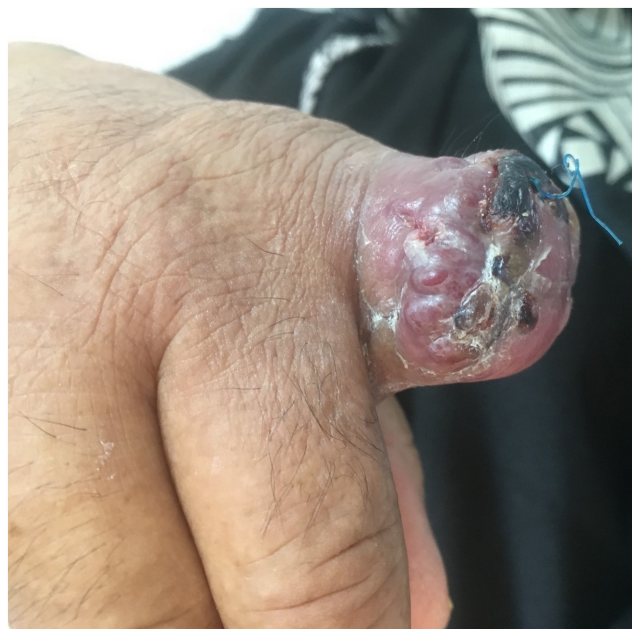
FIGURE 2 Orf lesion recurred after 2 weeks following the amputation