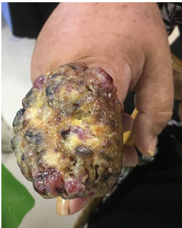
FIGURE 1 Giant orf lesion on the dorsum of the index finger of the right hand

A 70-year-old woman with an enlarging tumor on the dorsum of her right second finger presented to our clinic. She had been diagnosed with hairy cell leukemia 5 years ago. The patient had received rituximab and cladribine and was in complete remission. At the present time, she was not receiving any treatment for hairy cell leukemia. She had a history of cutting her finger while cleaning and preparing a sheep's head and one week later, a non-healing lesion developed on her right second finger. Four months after the lesion's appearance, she visited a surgeon. The lesion was removed with a shave excision, and the pathology reported it as granulation tissue. One month later, a rapidly growing, lobulated mass recurred at the site of the shaved biopsy, which grew to approximately 6x10 cm after several weeks (Figure 1). She visited a family medicine physician and was referred to a surgeon for an incisional biopsy to rule out possible malignancies. However, during the operation, the surgeon decided to amputate the digit due to the broad base of the tumor and tissue fragility and sent it to a pathology laboratory. The histopathologic examination revealed