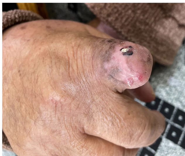
FIGURE 3 Complete resolution after 10 weeks of treatment with subcutaneous injections of interferon alfa-2a and topical imiquimod cream 5%

vacuolated epidermal cells with eosinophilic inclusion bodies in some keratinocytes (Figure 4). The pathology result in addition to the patient's history of the previous contact with sheep was consistent with the diagnosis of orf disease. Two weeks after the surgery, signs of recurrence were noticed, and the patient was referred to a dermatologist (Figure 2). Recurrent lesions were treated with cryotherapy (every two weeks) and topical imiquimod cream (three times a week). Despite treatment with topical imiquimod cream