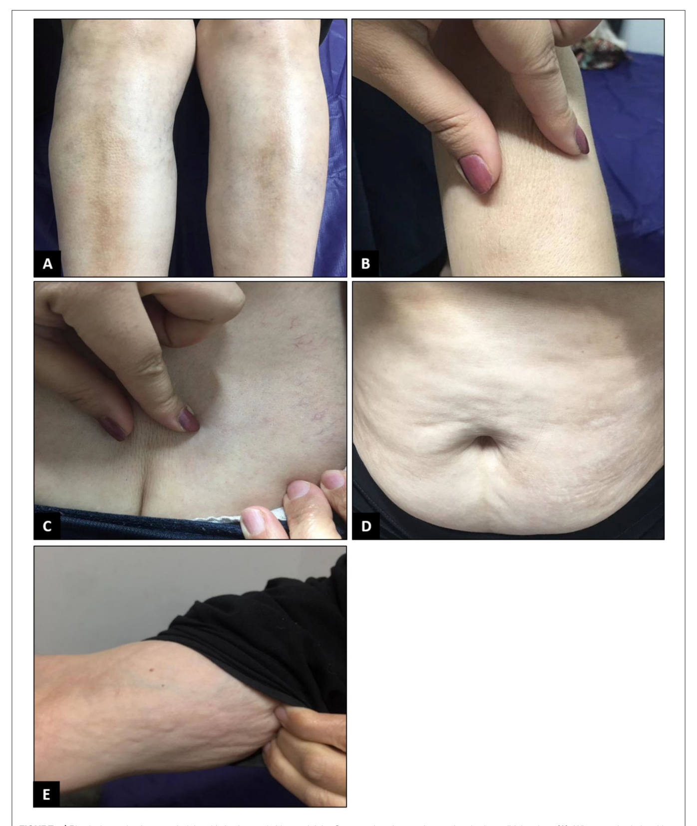
FIGURE 1 | Physical examination revealed the skin had turned shiny and tight. Severe sclerosis was detected on both pretibial regions (A). When touched, the skin felt rather sclerotic and lost the ability to fold compared to normal skin (B,C). Changes in the arm and lower abdomen in favor of morphea were also observed (D,E).